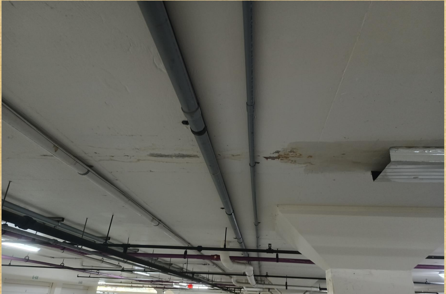
Exhibit 'M' – Parking spot 10 down from lap pool room stains from water leaks .

Date Reported: 11/19/22 Date reviewed: 5/22/23 Repair Status: Closed Fixed Gutter was removed and painted