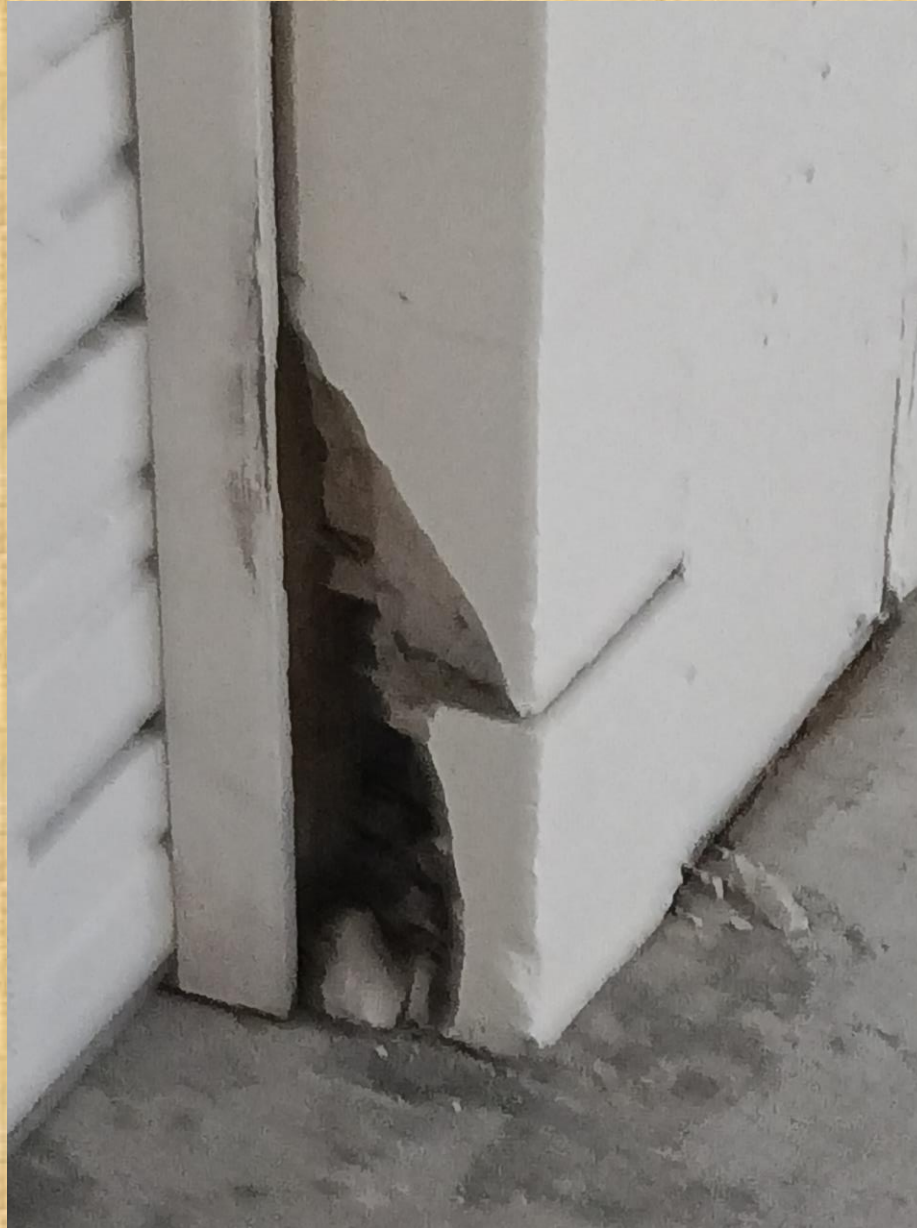
Exhibit 'K' – Garage 54 Column missing concrete.