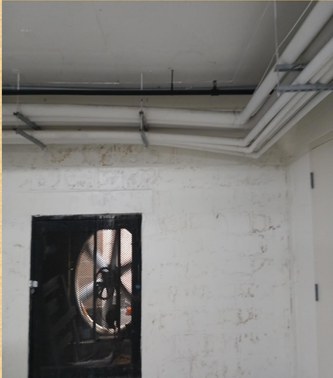
Exhibit 'L' – Lap Pool room walls showing signs of moisture needs paint.