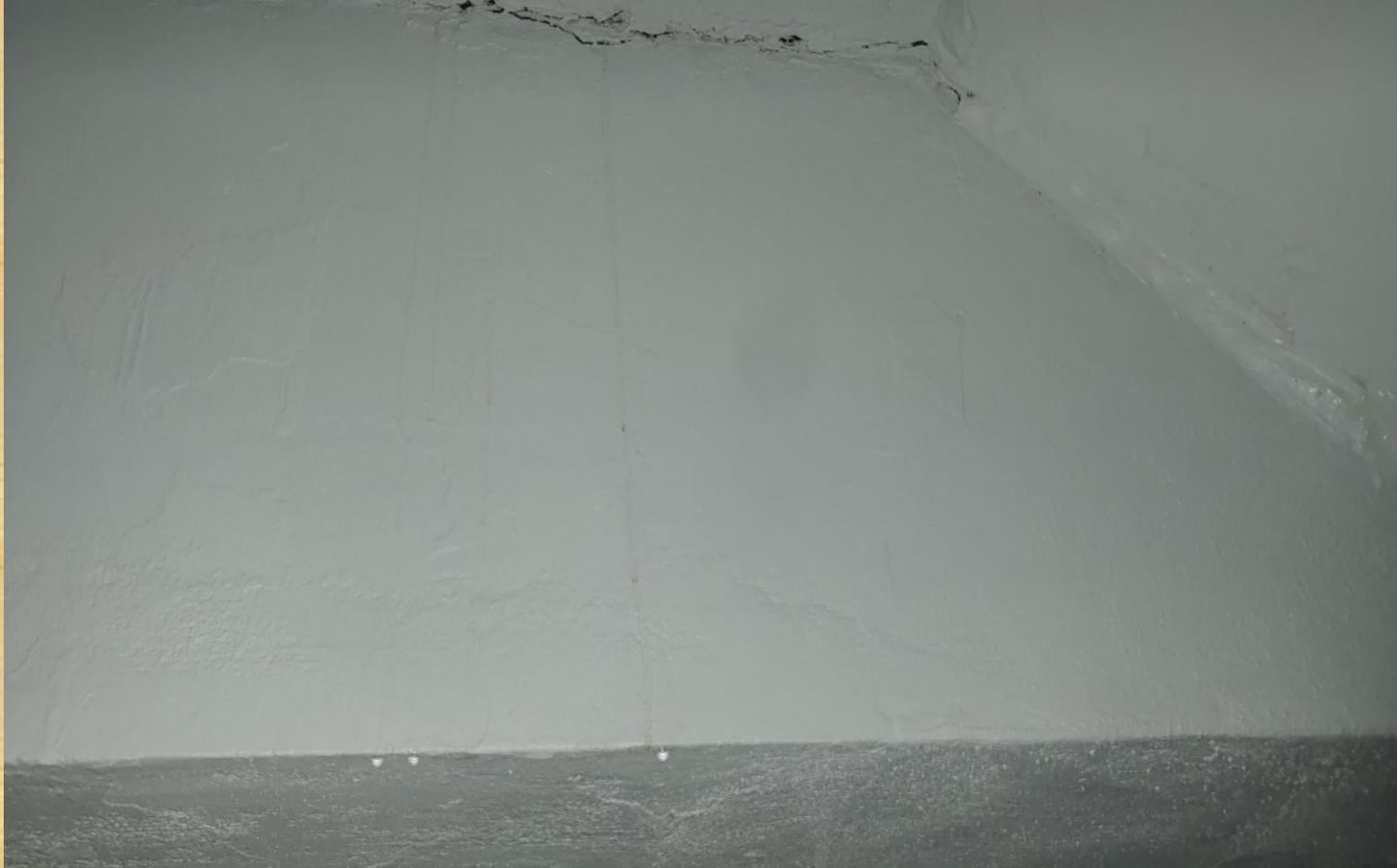
EXHIBIT 'A' – PARKING GARAGE UPON EXITING LOWER LOBBY COLUMN RECENTLY REPAIRED BUT IS STILL LEAKING FROM ABOVE.