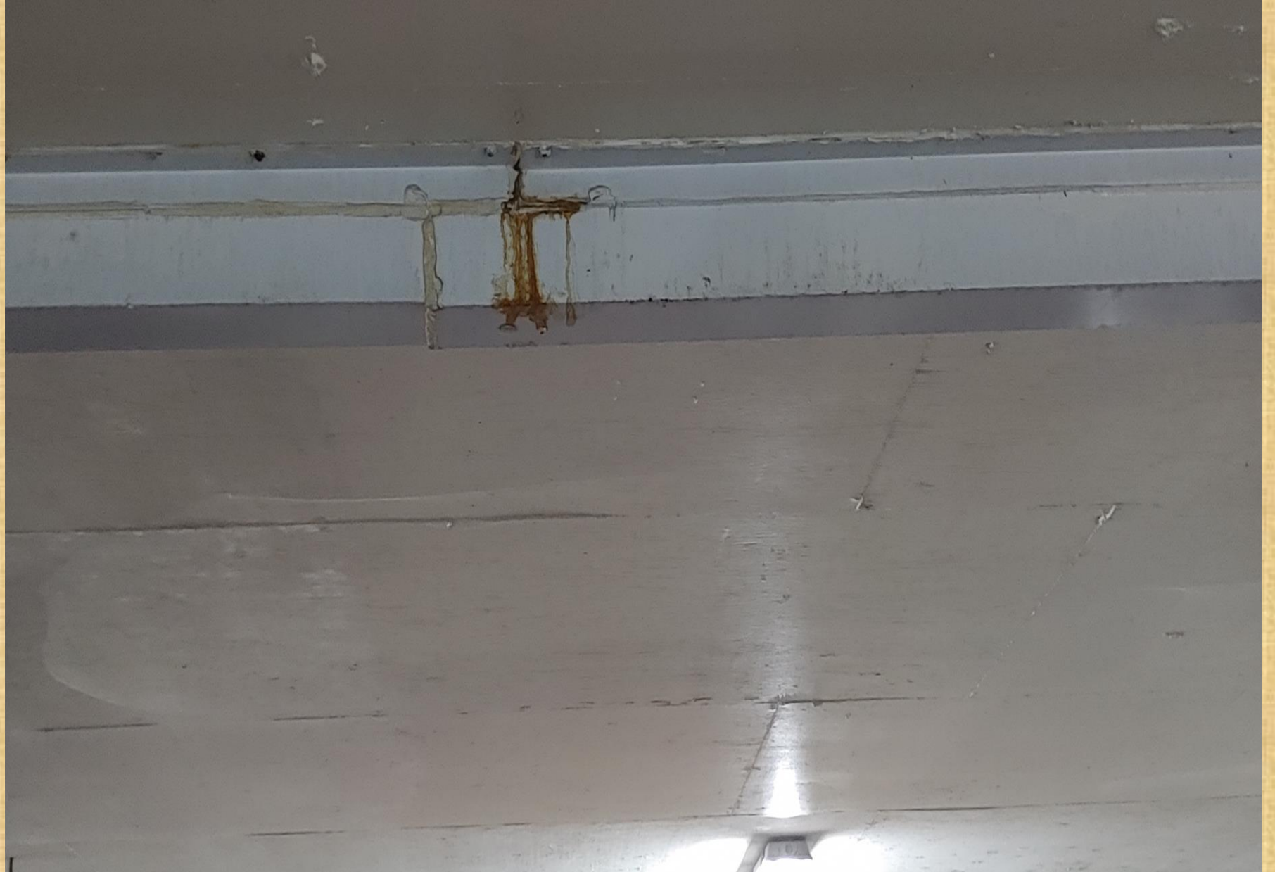
Exhibit 'E' – Water Leak Over Car by Bike Rack

Date Reported: 7/6/22 Date reviewed: 11/2/22 & 5/22/23 Repair Status: Not yet fixed