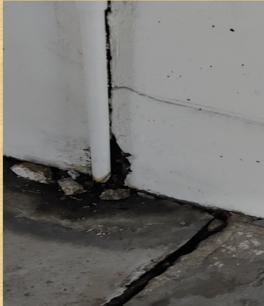
EXHIBIT 'D' – MISSING CONCRETE BOTTOM OF COLUMN.