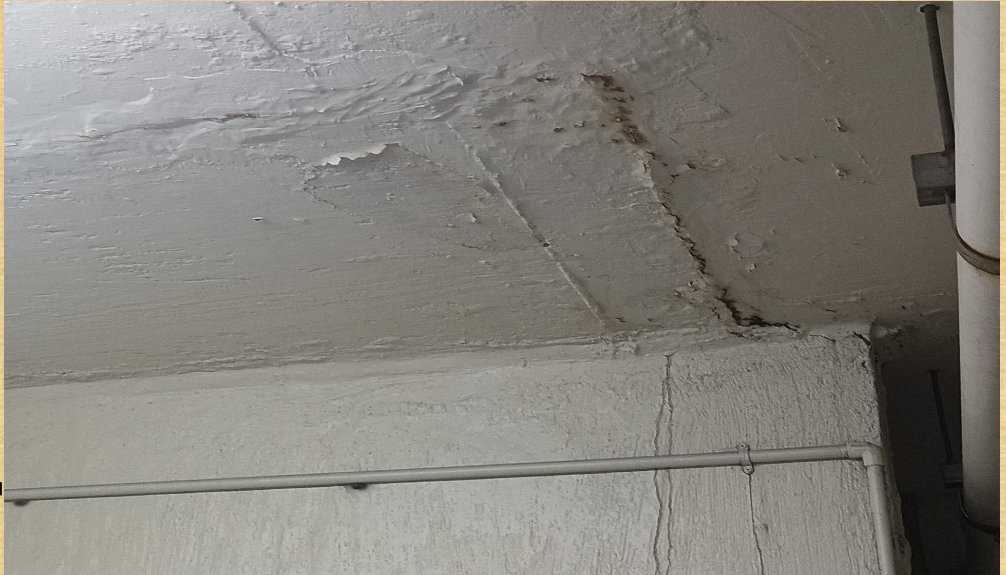
Exhibit 'O' – 72 hour parking next to walkway to Mickey Pool – Needs painting and caulk and there is evidence of previous leaks in ceiling needs paint.

Date Reported: 11/19/22 Date reviewed: 5/22/23 Repair Status: Not Yet Fixed