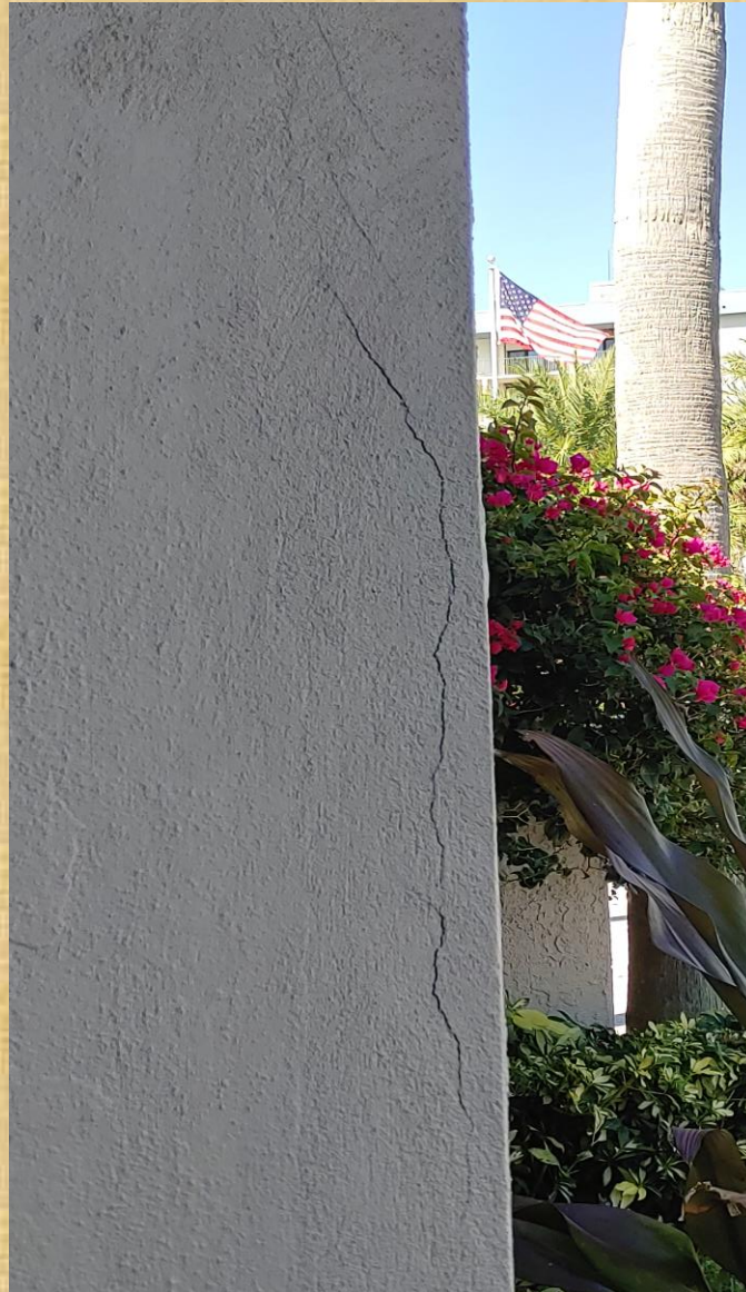
Exhibit 'G' – Entrance of Building II Garage - Recently Repaired Stucco is cracking.