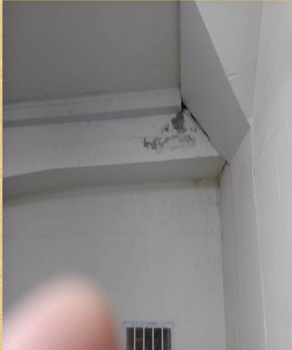
Exhibit 'N' – 72 hour parking next to G37 wall needs paint recaulking in column, and rusted grill.