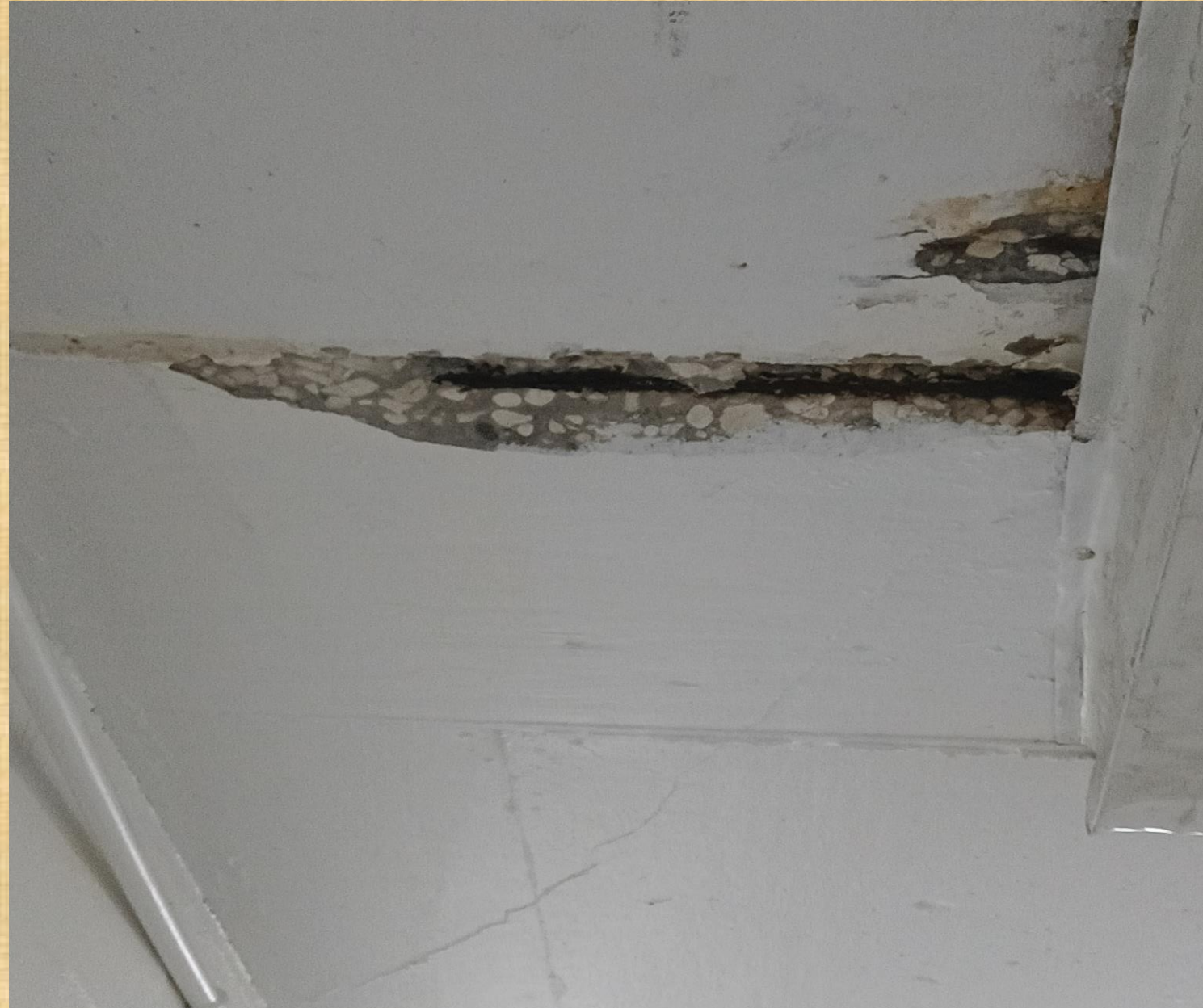
Exhibit 'F' – Stucco missing next to bike rack