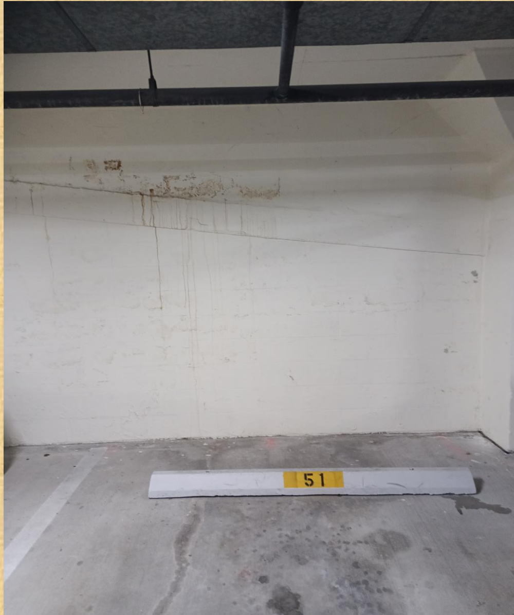
Exhibit 'J' – Wall Parking B50-B53 showing signs of moisture and peeling paint should be painted.