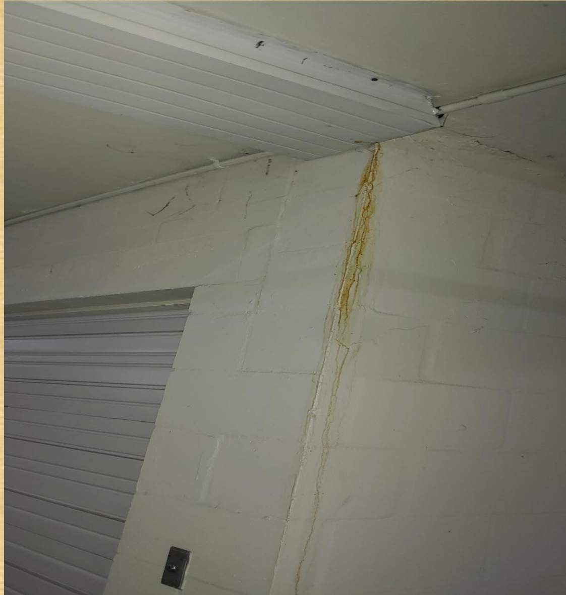
Exhibit 'B' – PARKING Garage. Upon exiting the lower lobby Ultimar II Next to Garage G62 Signs of leakage/water stains if corrected should be painted.