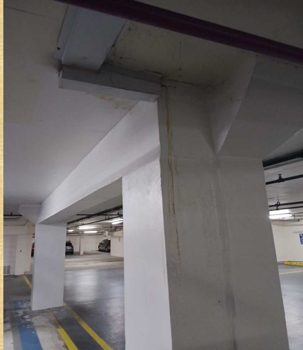
EXHIBIT 'A' – UPDATED PICTURE 11/19.