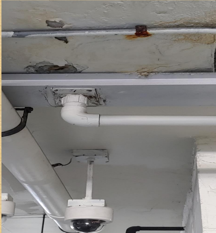
EXHIBIT 'C' – NEXT TO SCOOTER PARKING POSSIBLE LEAK MISSING STUCCO