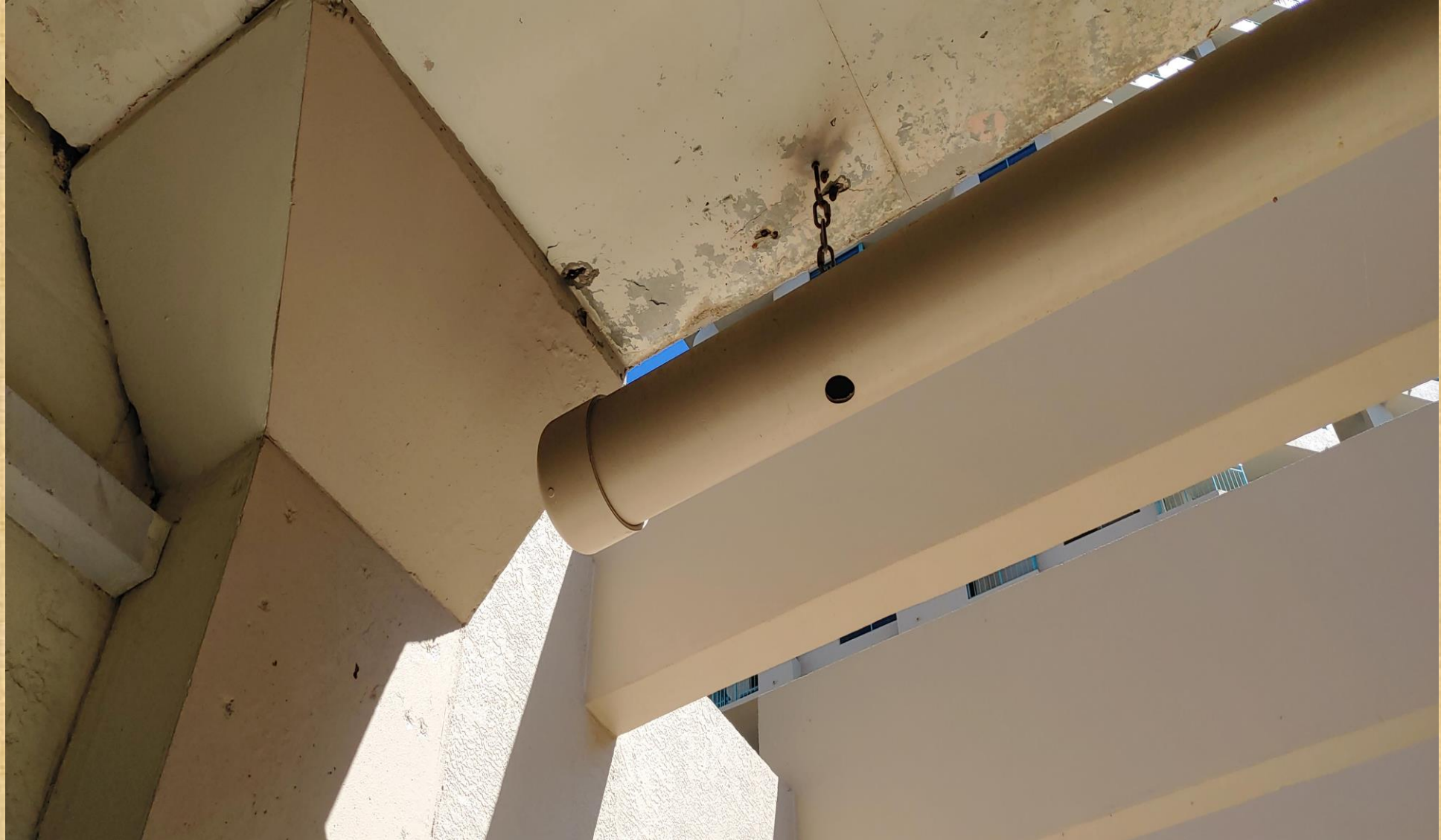
Exhibit 'H' – Loading Dock Left Corner Missing Stucco

Date Reported: 7/6/22 Date reviewed: 11/2/22 Repair Status: Fixed Closed